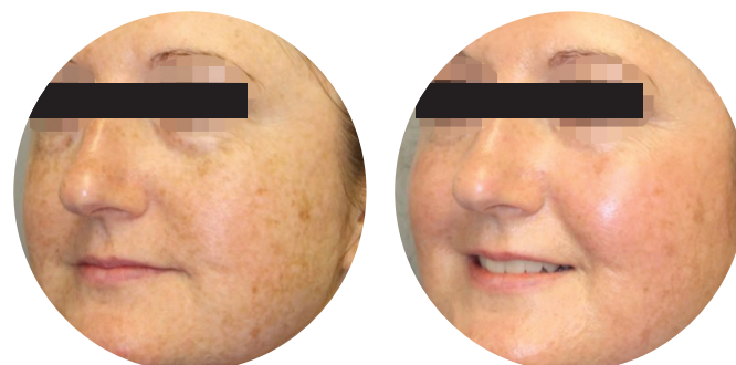
Cool Peel Treatment